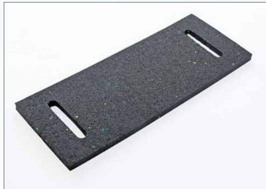
The underside of the Regupol® Webbing Protectors consists of robust, anti-slip Regupol® material.