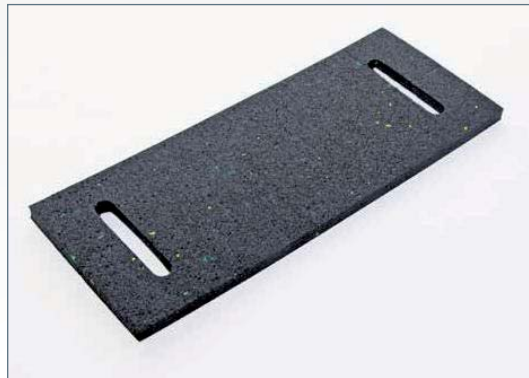
The underside of the Regupol® Webbing Protectors consists of robust, anti-slip Regupol® material.