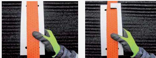
Regupol® Webbing Protectors can be fitted in just a few moves.