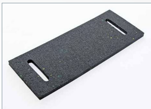
The underside of the Regupol® Webbing Protectors consists of robust, anti-slip Regupol® material.